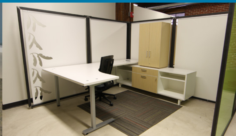
Finishes White with Blonde Echo